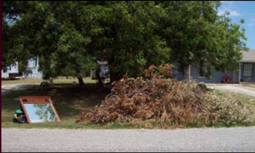
Accepted into the Bulk Waste and Brush Program.