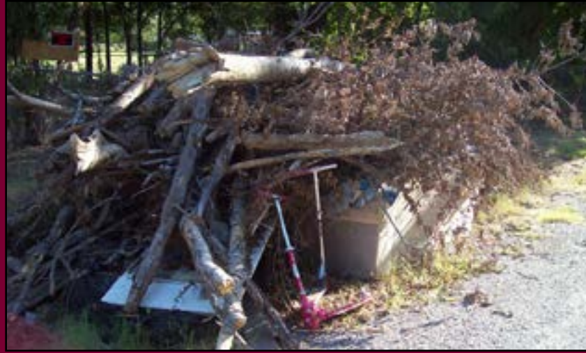
Not accepted into the Bulk Waste and Brush Program.